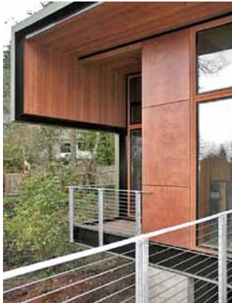
Some photographs of the Little Creek Residence illustrate the unfinished project while still under construction.