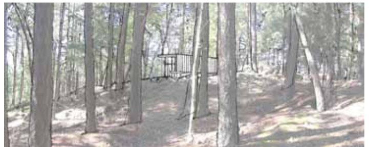
All photographs of the Decatur Cabin illustrate the unfinished project while still under construction.